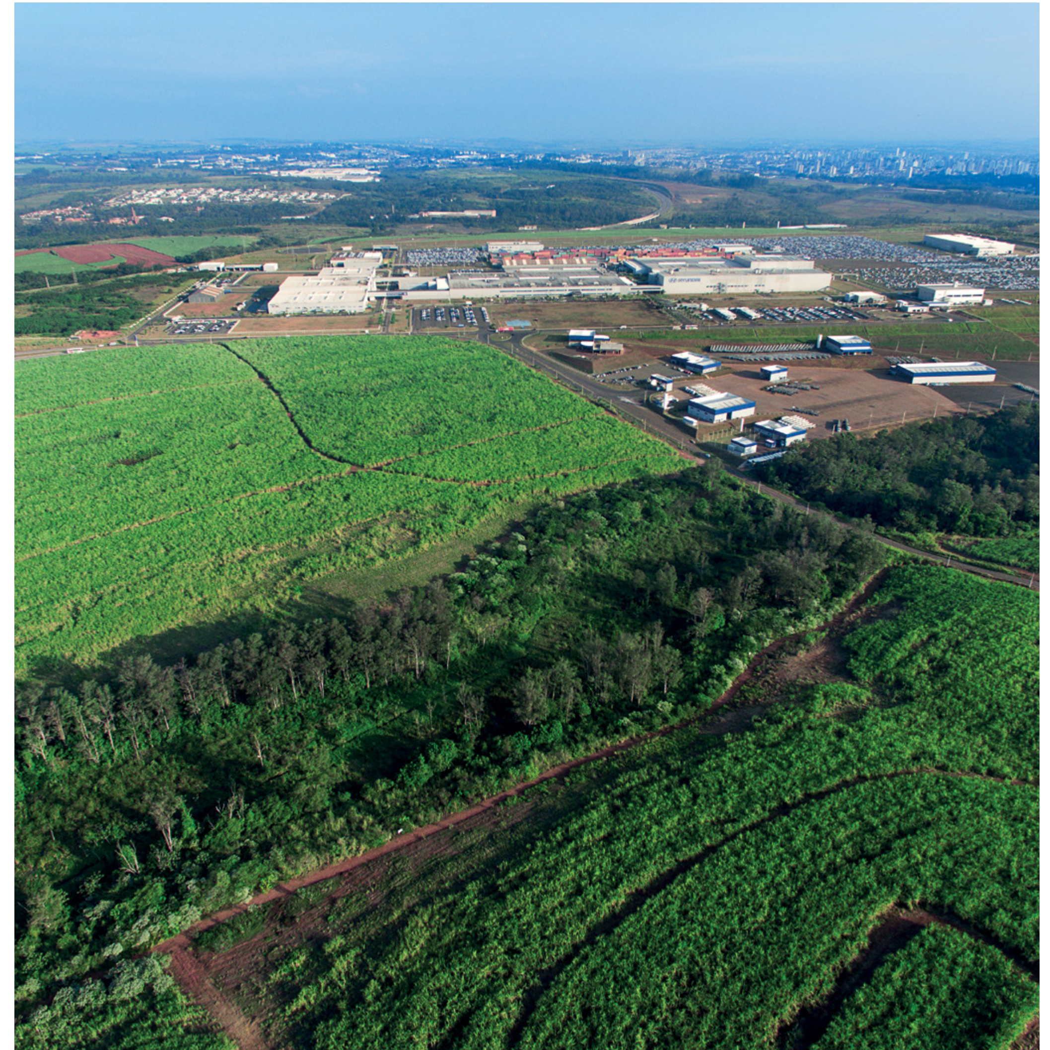
Hyundai planted 48,000 seedlings of native species near the factory in Piracicaba and reached the “zero landfill” goal, not sending waste to landfills.